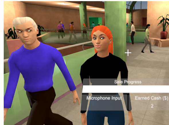
Figure 2: The player is in the process of selling to this woman. On the lower left, the sound volume picked up by the microphone is shown. On the lower right the money earned is shown. While selling, a progress bar appears.

The game was implemented in Unity , using characters with blend shapes . A special navigation system was created which casts multiple rays from each character, allowing them to sense the shape of the environment in front of them. The characters move in the direction of free space, except when they deliberately approach the player. Special Choreographer classes handle character animation. Current Choreographers include: HumanLocomotion (for controlling walking animation based on the speed of a character), HumanGaze (for controlling where a character is looking), HumanHead (for head